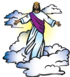
The Second Coming of Christ